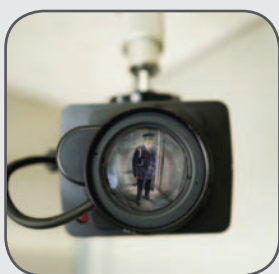
FOR MORE SEE WWW.NEC.COM.AU

Kyocera not only has the lowest running costs of any printer and copier brand in Australia, but a long-standing commitment to reducing environmental impact through product design and business practices.