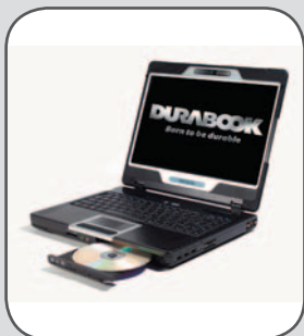
FOR MORE SEE WWW.TWINHEAD.COM.AU

"Security compliance means a company can provide IT security controls and show proof of compliance while automating processes. This ensures streamlined, consistent compliance procedures."