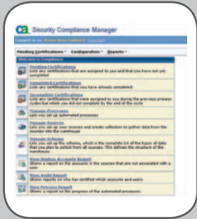
FOR MORE SEE WWW.CA.COM

The drives are easy to use and have no admin rights or application installation requirements.