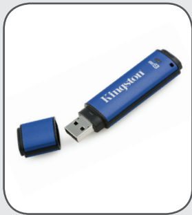
FOR MORE SEE WWW.KINGSTON.COM.AU